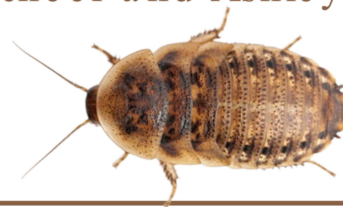
What habitat do roaches prefer?

Phase 2: After recording the data in the first phase, the deterrents were added to the preferred habitat. Every 2 minutes, the roaches were counted, and the results of their locations were recorded. This process was replicated 3 times for each material, for a total of 9 replicates.